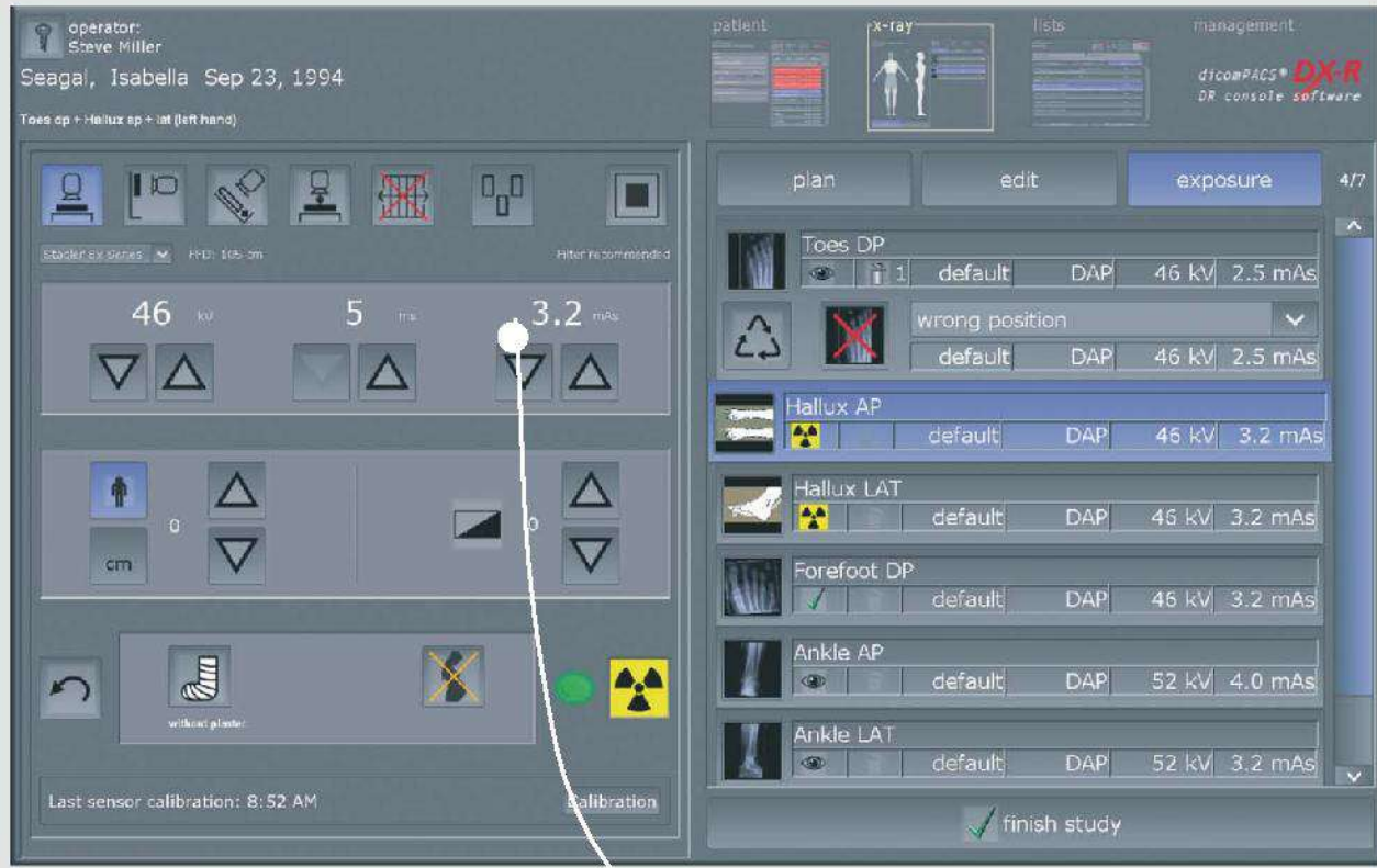
dicomPACS ® DX-R generator control

Opens examples of inaccurate X-ray images with comments