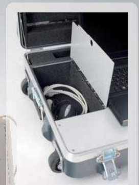
Compartment for mouse and cables

Just switch on the laptop, connect the detector with the X-ray unit and start making exposures.