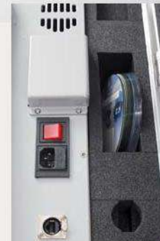
Compartment for patient CDs and general on-off switch